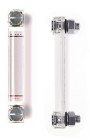
ELESA Original design

In any case we suggest to verify the suitability of the product under the actual working conditions.